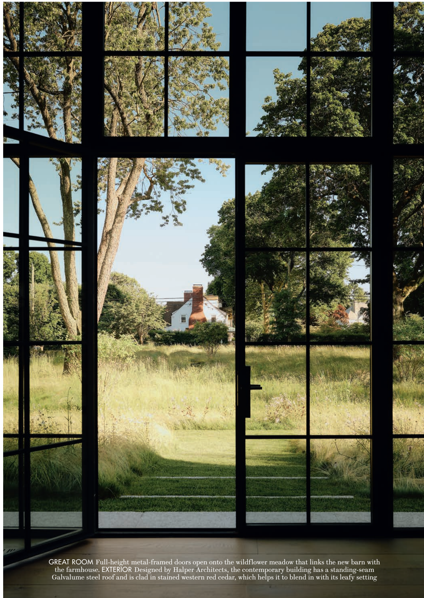
GREAT ROOM Full-height metal-framed doors open onto the wildflower meadow that links the new barn with the farmhouse. EXTERIOR Designed by Halper Architects, the contemporary building has a standing-seam Galvalume steel roof and is clad in stained western red cedar, which helps it to blend in with its leafy setting