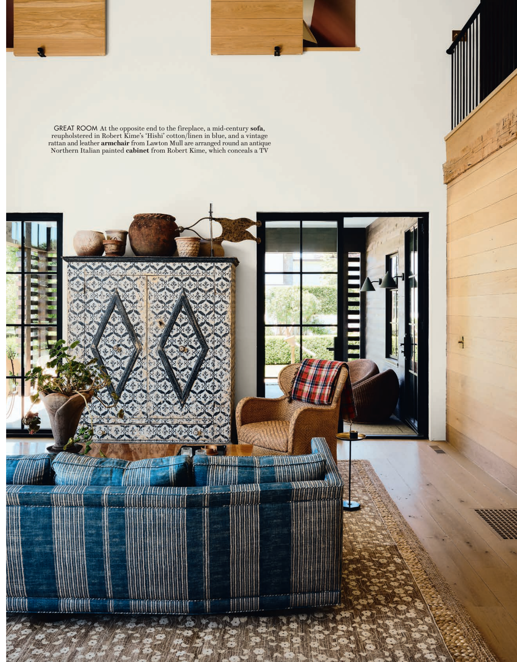
GREAT ROOM At the opposite end to the fireplace, a mid-century sofa , reupholstered in Robert Kime's 'Hishi' cotton/linen in blue, and a vintage rattan and leather armchair from Lawton Mull are arranged round an antique Northern Italian painted cabinet from Robert Kime, which conceals a TV