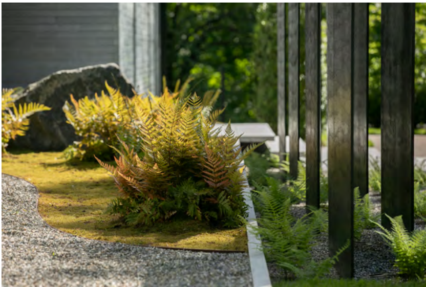
The rear garden and pool were deliberately sited to protect and highlight existing natural resources like this extensive stone outcropping, photographed from above.